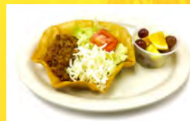
Mini Taco Salad $7.25 A mini-version of our famous Taco Salad, with your choice of Ground Beef, Shredded Chicken or Shredded Beef. Filled with refried beans, red rice, lettuce, cheese dip, shredded cheese, guacamole, sour cream, and tomatoes. Does not come with a side. Steak or Grilled chicken +$1.50