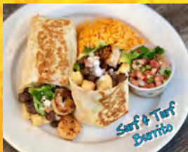
Surf & Turf Burrito

A large burrito filled with Shrimp and Steak, lettuce, french fries, shredded cheese, pickled jalapeños, guacamole and our house made baja slaw. Served with red rice on the side.