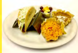
Kid's Taco (soft or crispy) $7.00 Choice of Soft or Crispy taco filled with Ground Beef, Shredded Chicken or Shredded Beef, topped with lettuce and cheese. Steak or Grilled Chicken $1.50