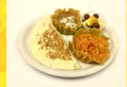
Kid's Quesadilla $7.00 A plain cheese quesadilla, or get it filled with Ground Beef, Shredded Chicken or Shredded Beef. Steak or Grilled Chicken +$1.50