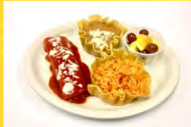
Kid's Enchilada $7.00 An enchilada filled with your choice of Ground Beef, Shredded Chicken, Shredded Beef, Cheese or Bean.