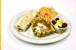
Peanut's Burrito $7.00 A small burrito, grilled on our panini, filled with cheese and choice of Ground Beef, Shredded Chicken or Shredded Beef. Steak or Grilled Chicken +$1.50

Any additional item added to kids meal (extra taco, extra corn dog, extra burrito) will cost $2.50 more. Add $1.50 for those 13 years and up.