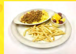
Mac n' Meat $7.25 Macaroni and cheese mixed with Ground Beef.