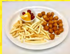
Kid's Popcorn Chicken $7.25 An order of Popcorn Chicken served with your choice of side.