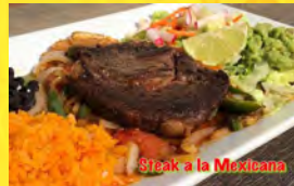
Steak a la Mexicana

A savory 8oz Ribeye Steak, served over a bed of grilled jalapeños, onions, and tomatoes. Served with red rice, black beans, lettuce and guacamole.